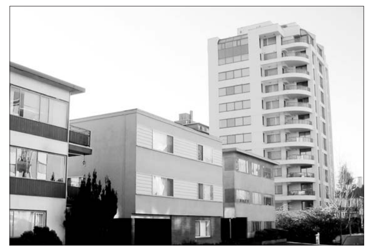
Typical RM-3 zoned neighborhood

An example of an area that requires an extreme makeover is Marpole, especially